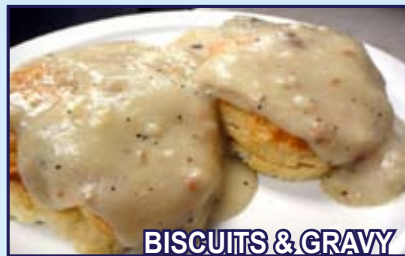
BISCUITS & GRAVY

Hot biscuits topped with sausage gravy 4.95