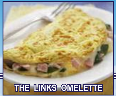
THE LINKS OMELETTE

Served 8:00 AM to 11:00 AM Weekdays 7:00 AM to 11:00 AM Weekends